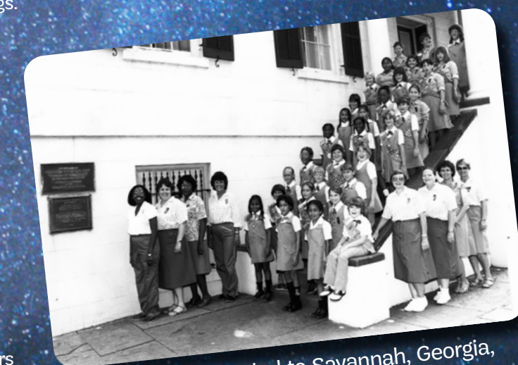
1984 - We traveled to Savannah, Georgia, the birthplace of Juliette Gordon Low

*A call for volunteers will be made throughout this guide, whether to make ratio or assist in facilitating activities at an event. Any adult who supervises girls must be at least 18 years old and screened before volunteering.