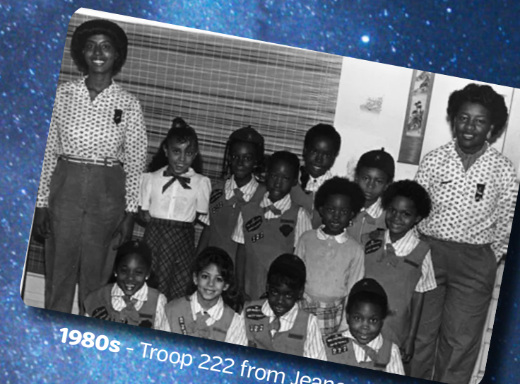
1980s - Troop 222 from Jeanerette, LA

Additional adult trainings are added on a regular basis. Please visit our event calendar at gslpg.org for additional information.