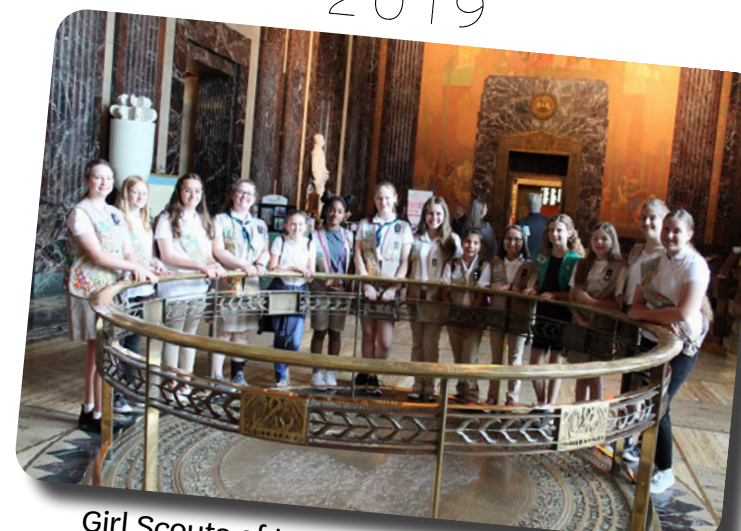
Girl Scouts of Louisiana - Pines to the Gulf