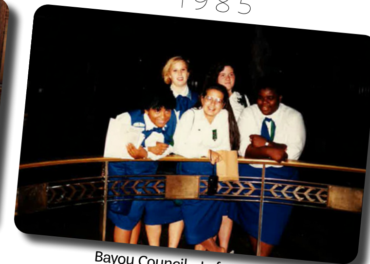
Bayou Council - Lafayette La.