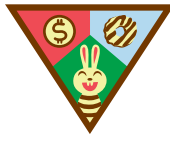
My Cookie Customers