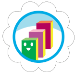
My First Cookie Business

Earn one of the Cookie Business badges to help you discover new skills. Each badge has digital marketing skills built right in.