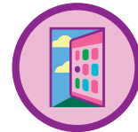
My Cookie Team