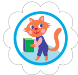
Cookie Goal Setter