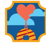
My Cookie Business Resume