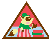
Cookie Decision Maker