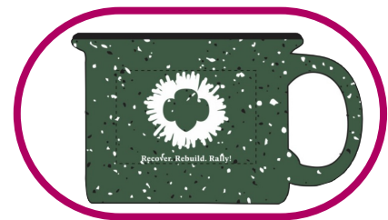
Recover. Rebuild. Rally! mug

PARTNER: $250 one time gift OR sustainable gift of $21 monthly