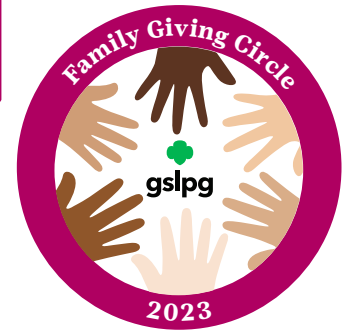
Family Giving Circle Patch

FRIEND: $30 one time gift OR sustainable gift of $2.50 monthly